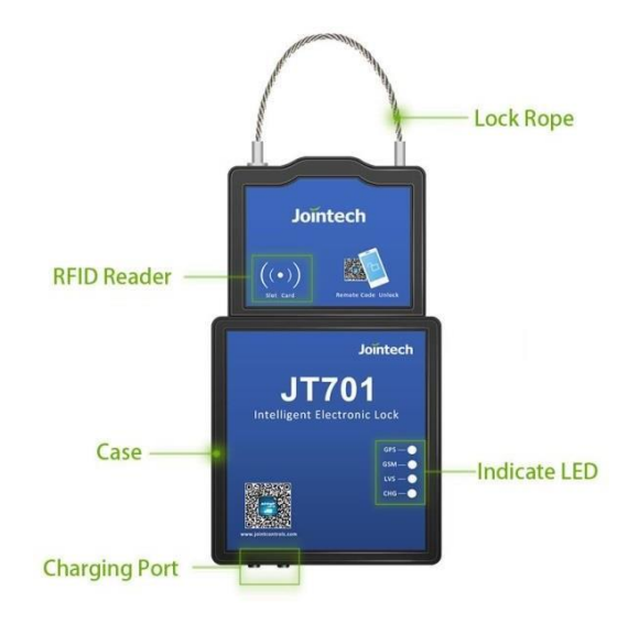
Figure 1. Smart Lock JT701

Tracker smart lock type JT701, as shown in Figure 1. There are 4 main blocks, namely the GPS Tracker installed on the cargo vehicle, GSM/3G cellular network, server, and application to the user in the form of a website and Android program for smartphone users.