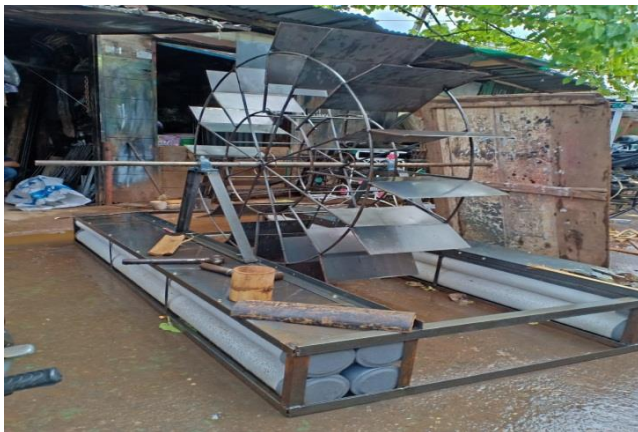
b. Assembling Water Wheel