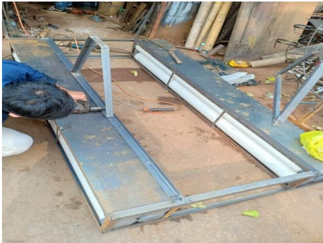
a. Pontoon Fabrication of Water Wheel